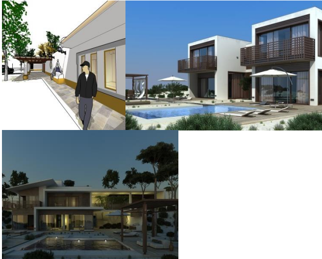
Herdade do Mar